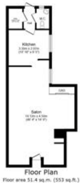
Floor area 51.4 sq.m. (553 sq.ft.)

Total floor area: 51.4 sq.m. (553 sq.ft.)