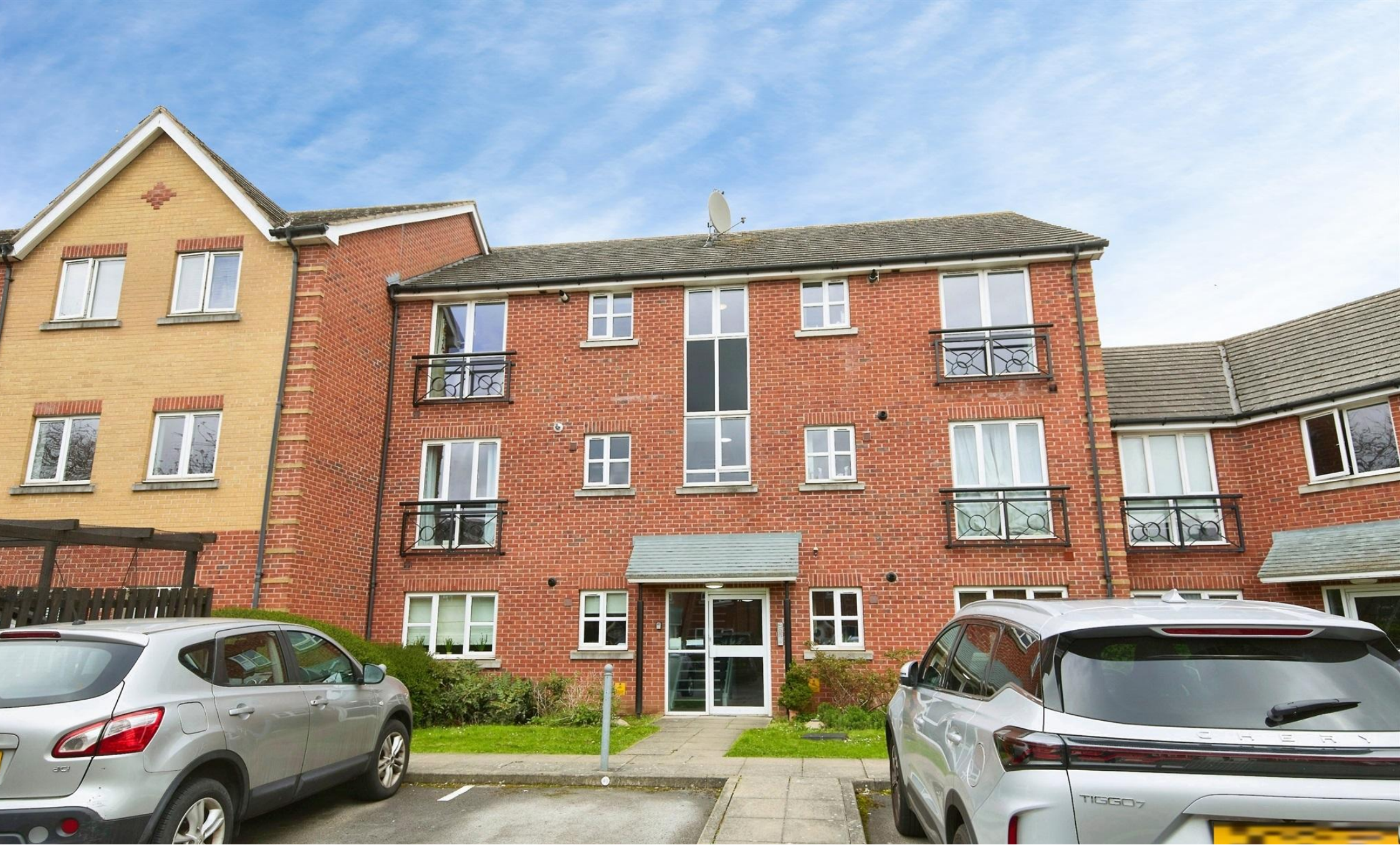
Ashwood Close, Derby DE24 8XW