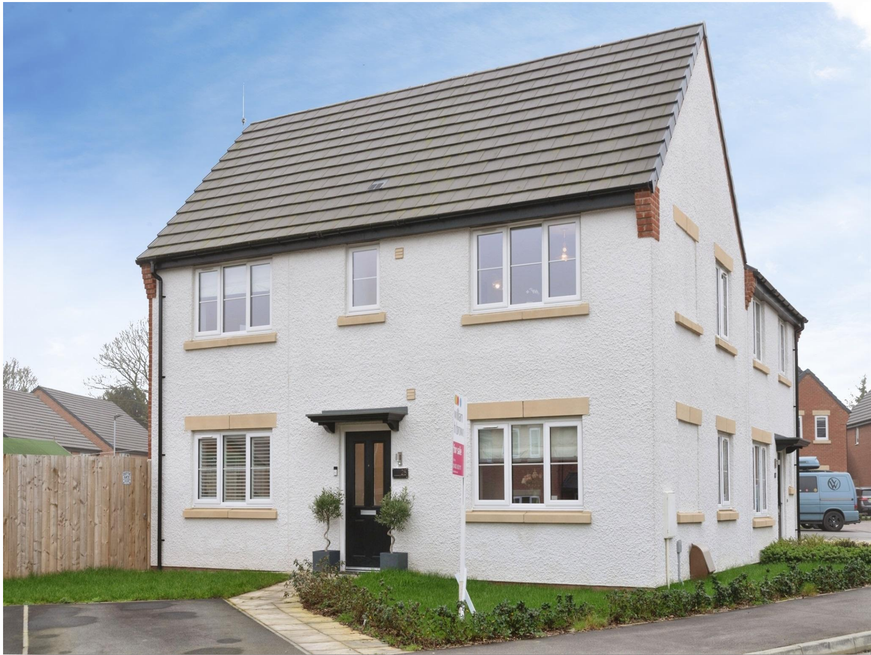
Nightingale Drive, Kirk Ella HU10 7GY