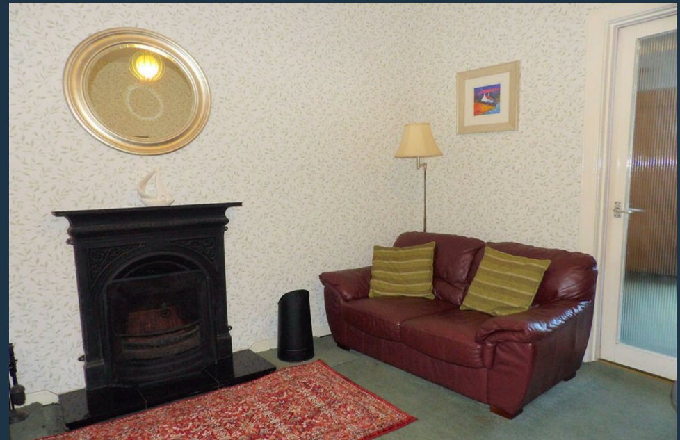
The accommodation is in walk into condition and decorated in neutral tones throughout.