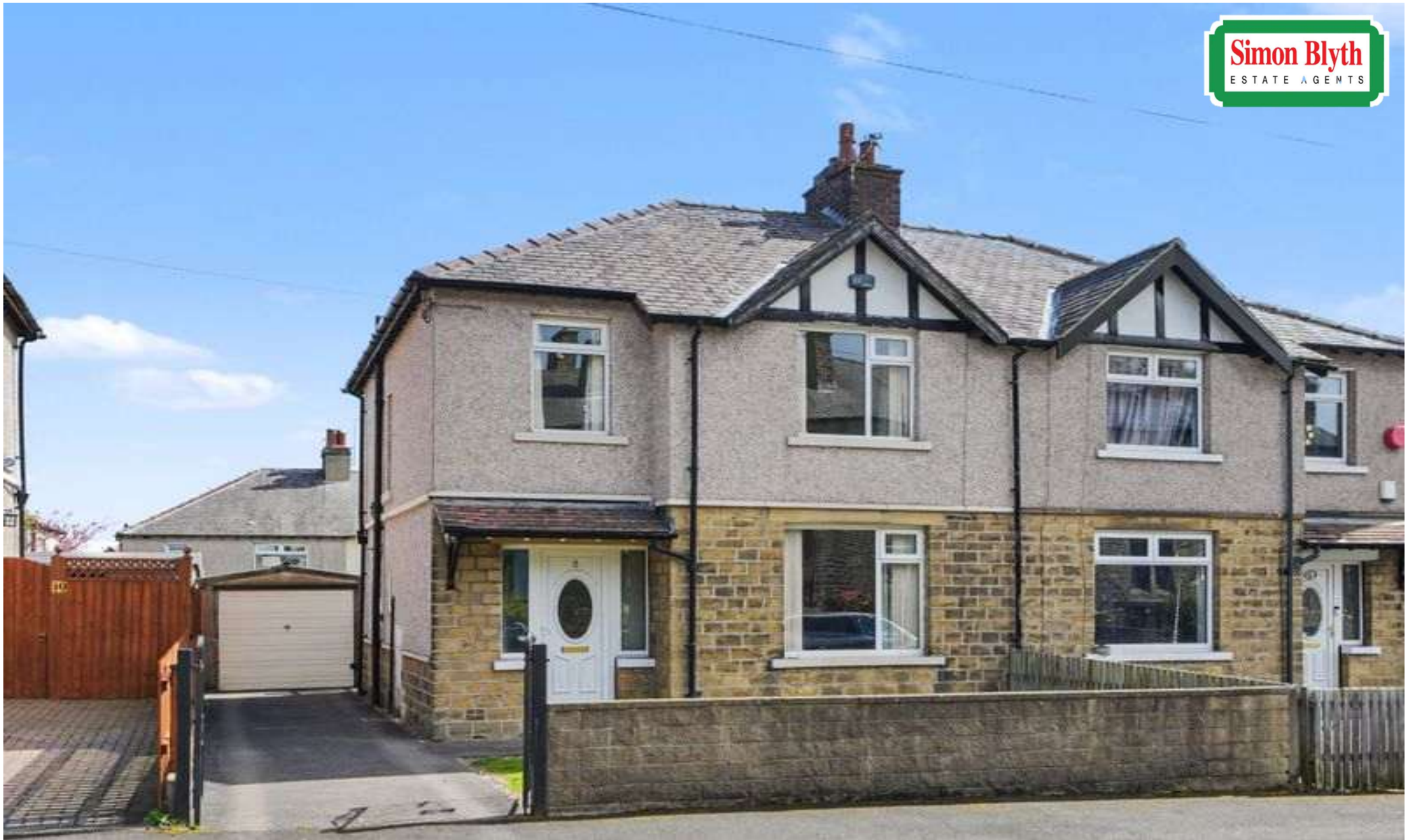
8 Alexandra Road, Lindley, Huddersfield, HD3 3DP