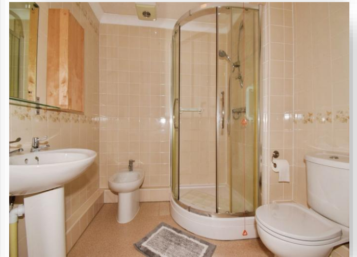
Hendon Grange London Road, Leicester LE2 2PZ