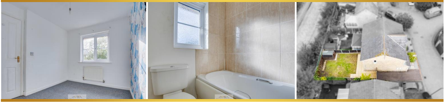
GROUND FLOOR 414 sq.ft. (38.4 sq.m.) approx.