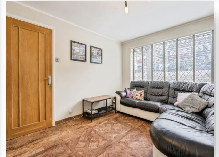
Littlewood Close, Plymouth PL7 2HB