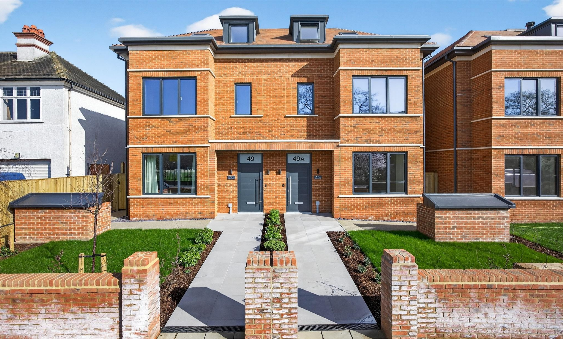
Hollybrook House Abbotswood Road, London SW16 1AJ