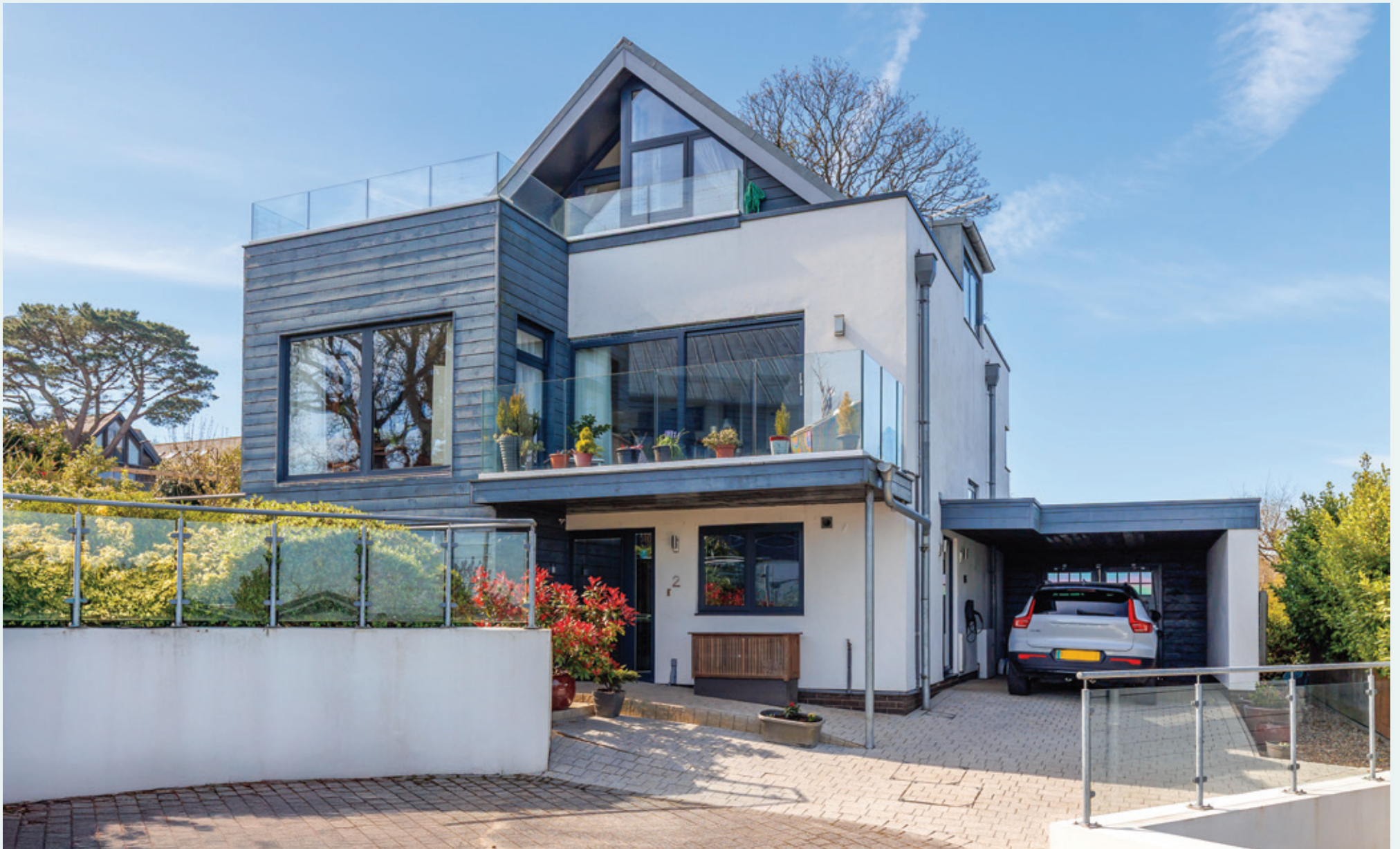
2 Solent Heights, Cowes, Isle of Wight