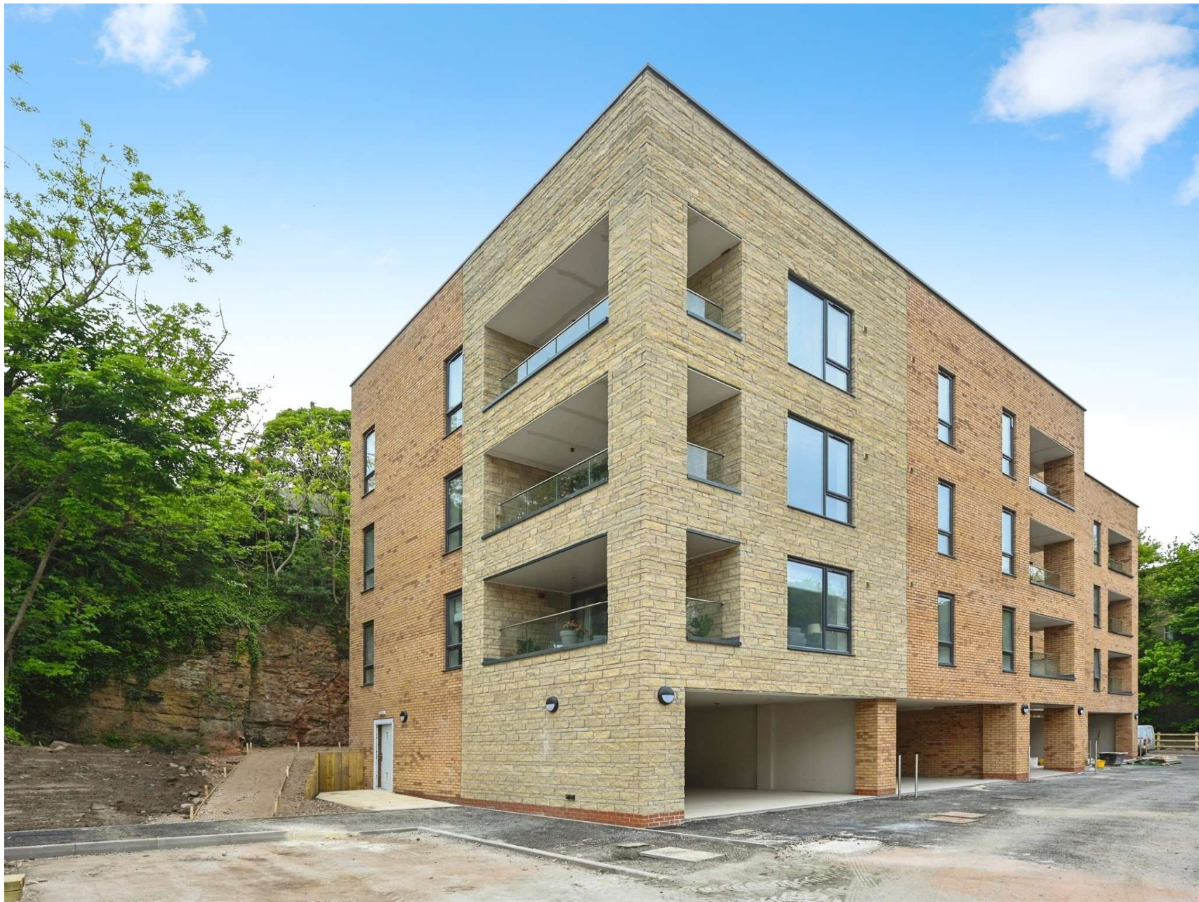
Mustard Mills Luxury Apartments Valley Lane, Mansfield NG18 2HT