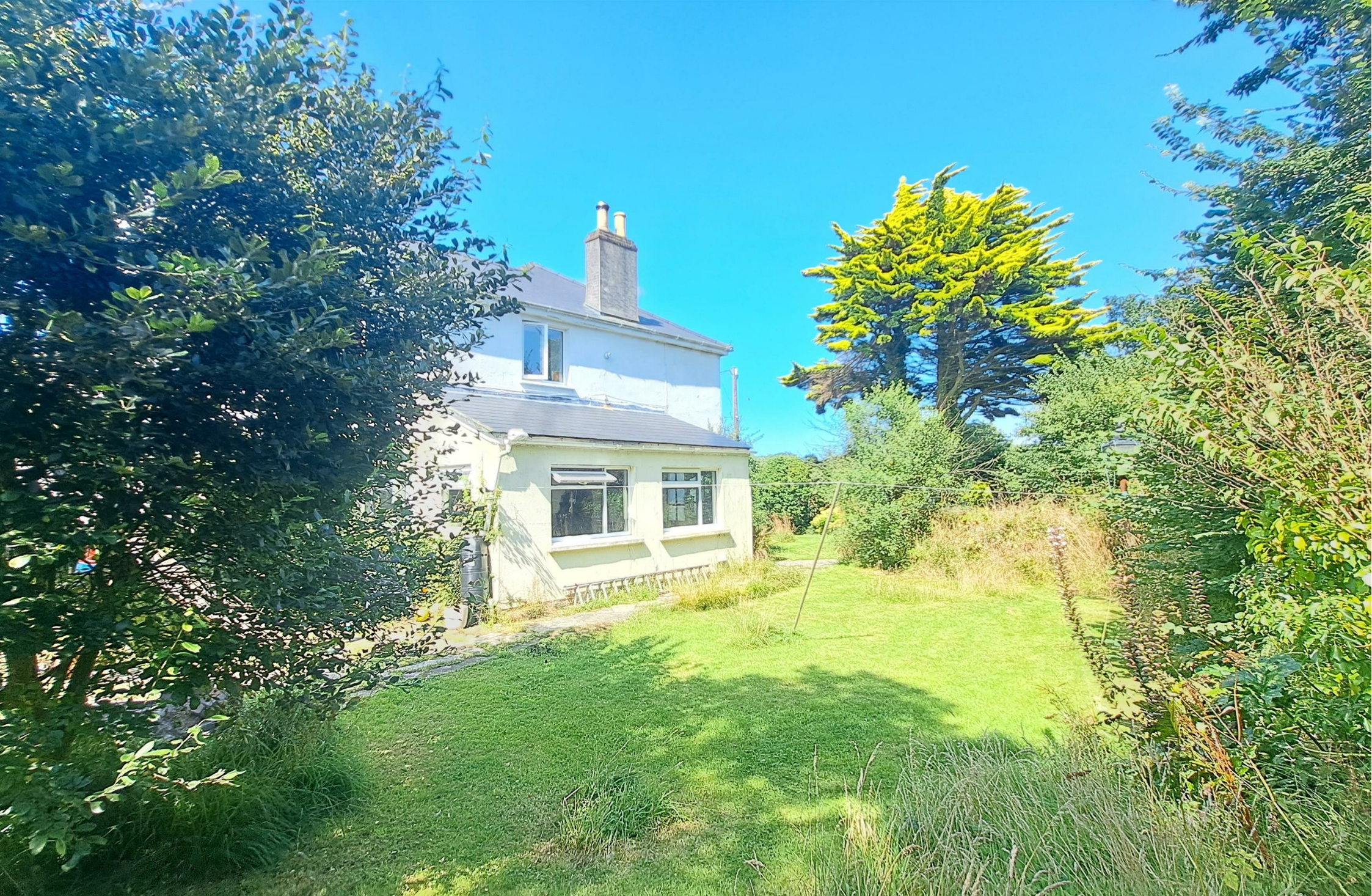
Cathebedron Road, Carnhell Green, TR14 0NB