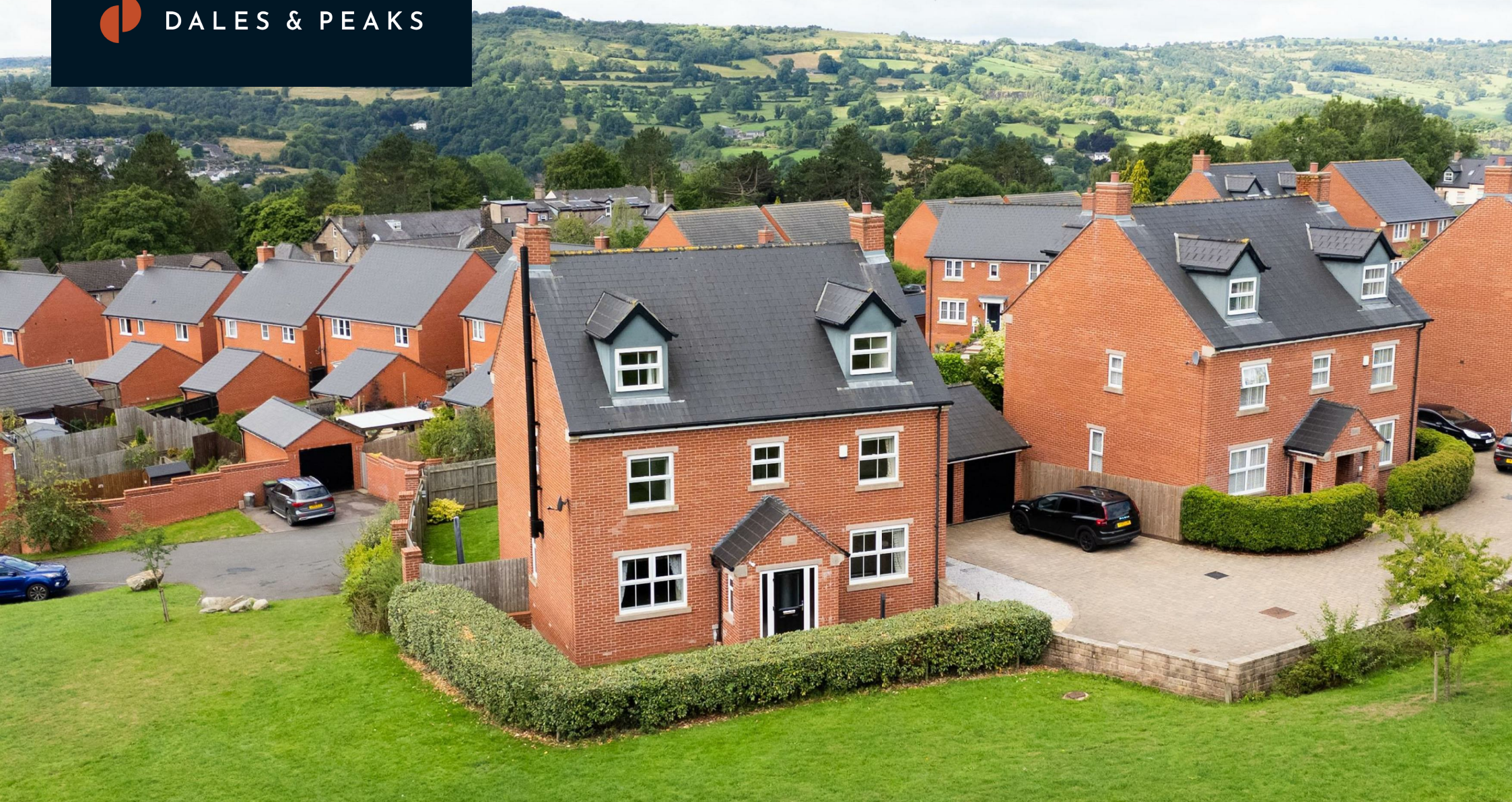
1 Pingle Rise Matlock, DE4 3TN