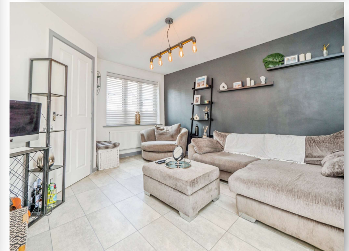
Boyce Way, Old St. Mellons Cardiff CF3 6AB