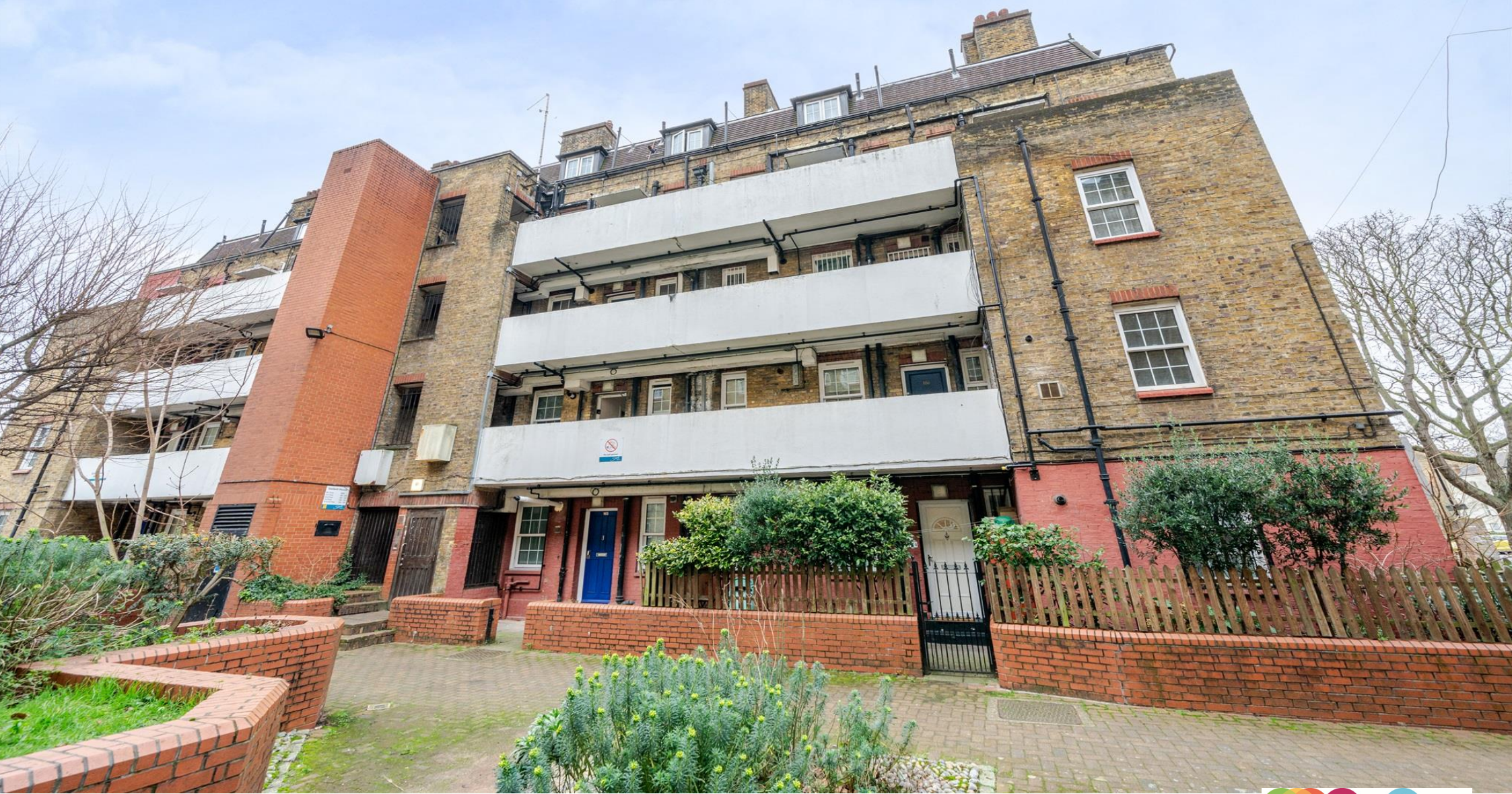
Garbett House Doddington Grove, London SE17