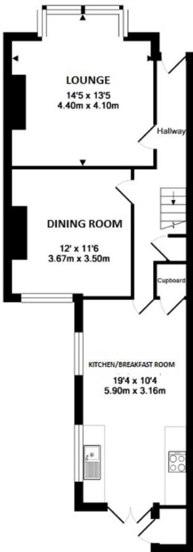
Ground Floor Approx. Floor Area 621 Sq.Ft. (57.7 Sq.M.)