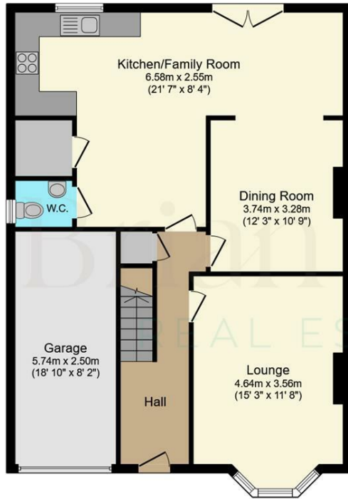
Ground Floor Floor area 91.1 sq.m. (980 sq.ft.)