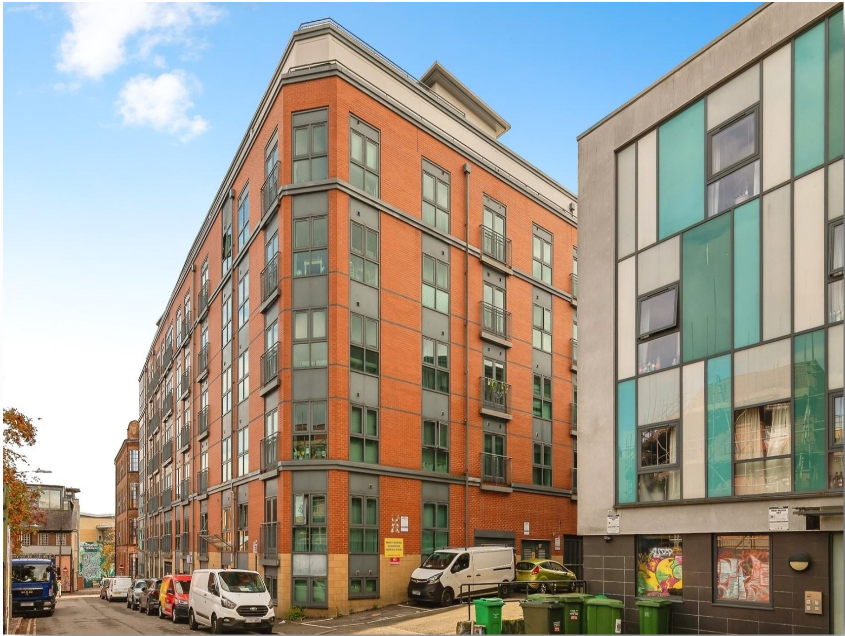
The Habitat Woolpack Lane, Nottingham NG1 1GH