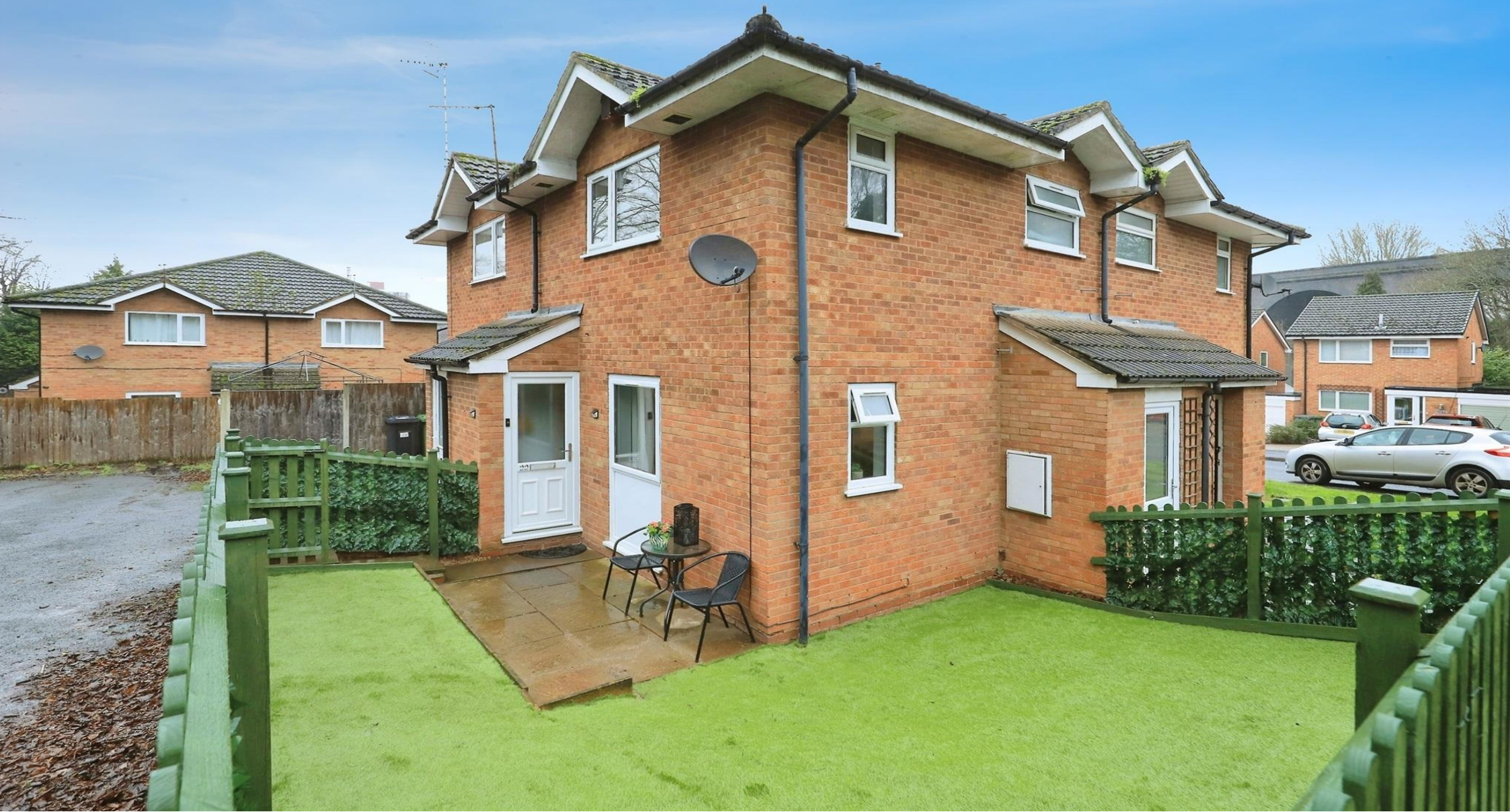
Humphries Drive, Kidderminster DY10 1XQ

Not for marketing purposes INTERNAL USE ONLY