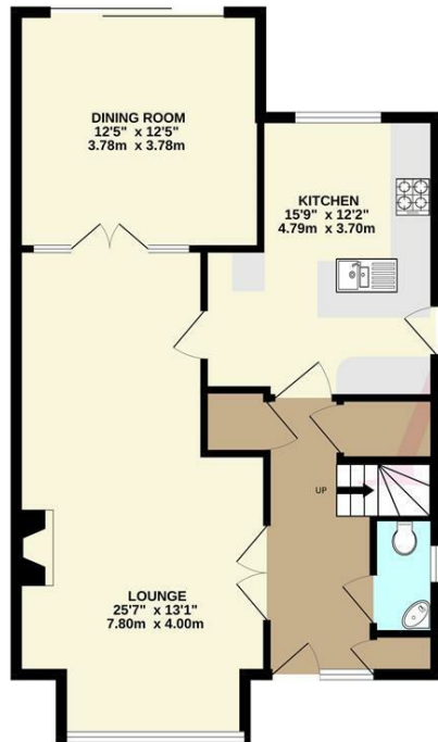
GROUND FLOOR 905 sq.ft. (84.1 sq.m.) approx.