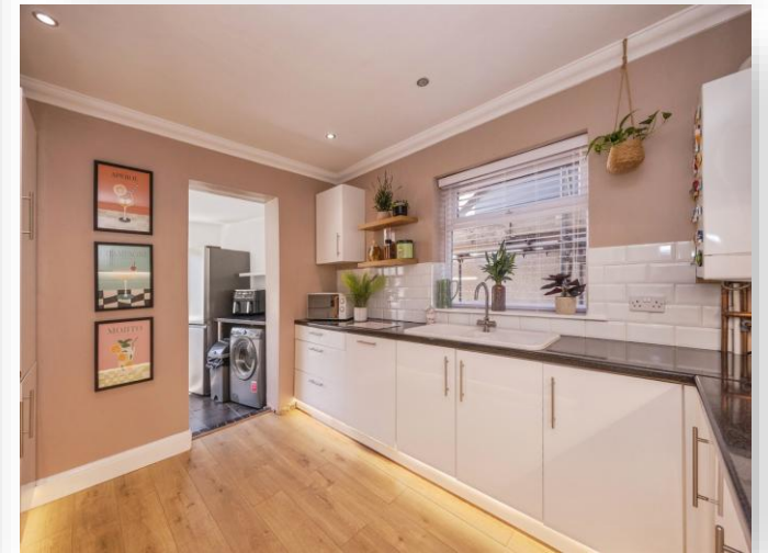
Alameda Way, Waterlooville PO7 5HB