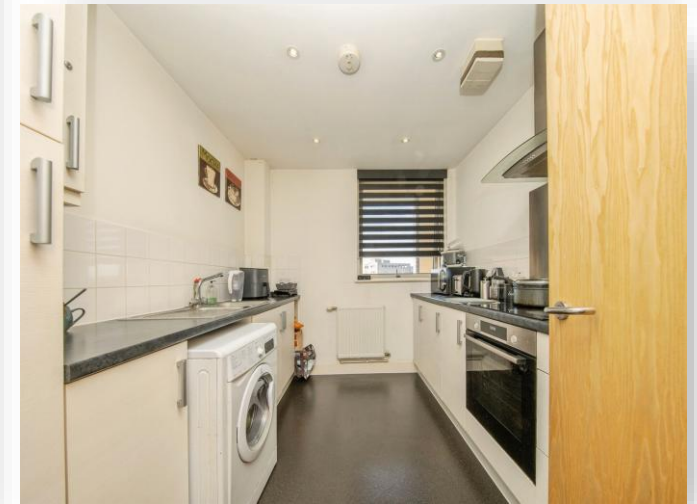
Avalon Court, Great Whip Street, Ipswich, IP2 8FA