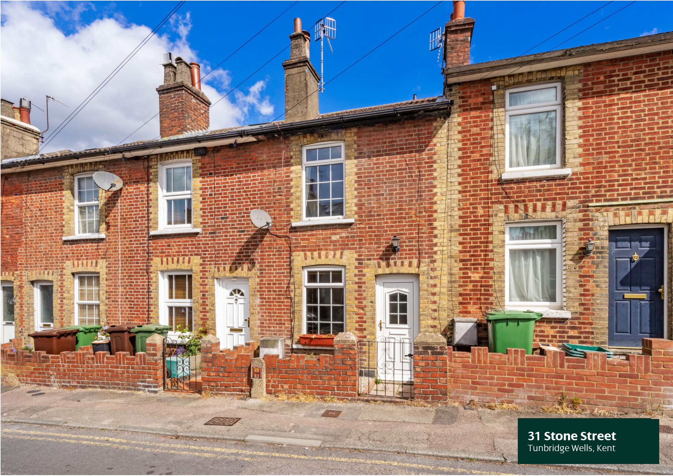
31 Stone Street Tunbridge Wells, Kent