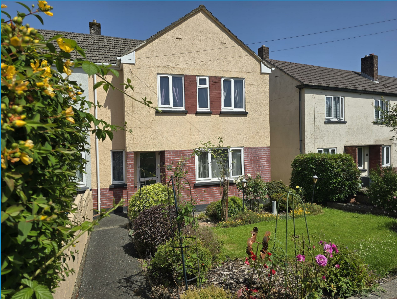
Hurdon Way Launceston | Cornwall