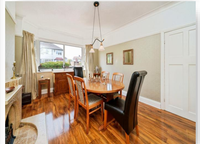
Braemore Road, Wallasey, CH44 2BL