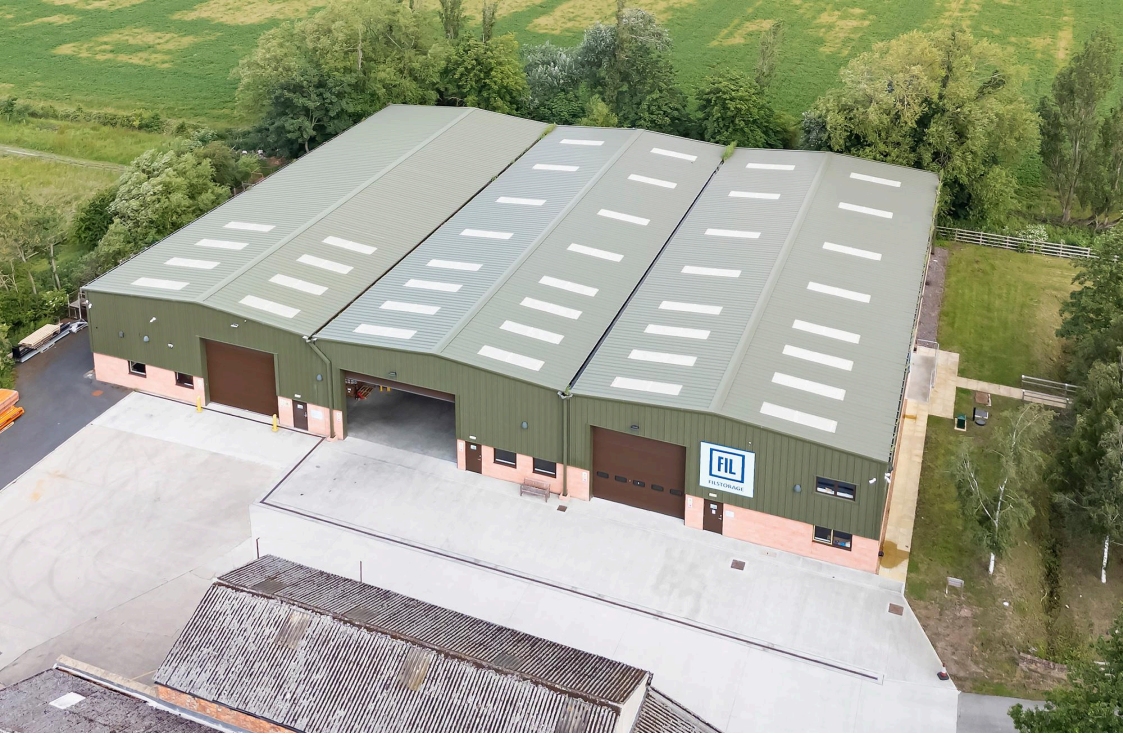
A SUBSTANTIAL FAMILY HOME WITH WAREHOUSES, BARNs, STABLES & 9 ACRES