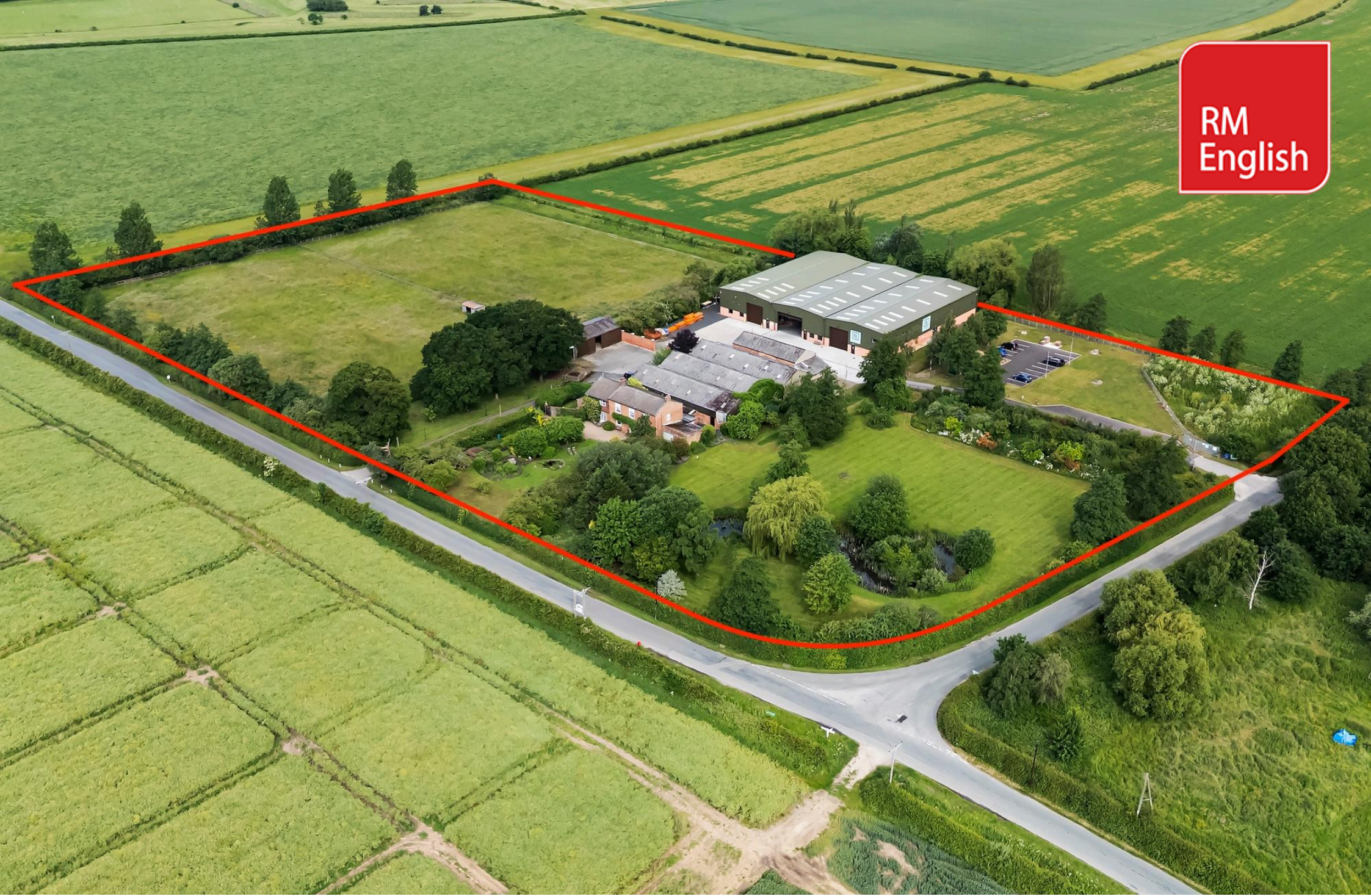
Sandwood House, Spaldington, DN14 7NG