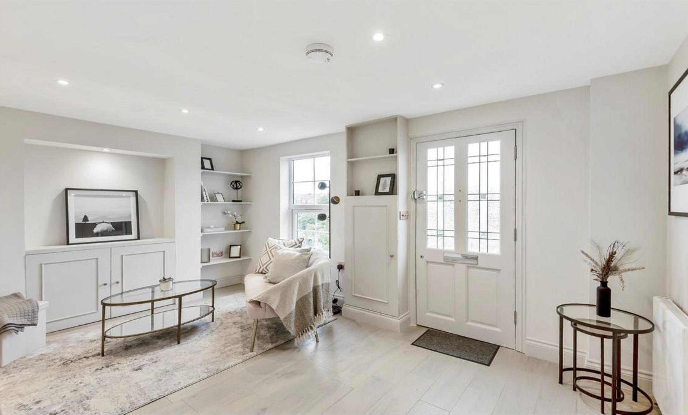
Model Cottages, London, W13 9LF