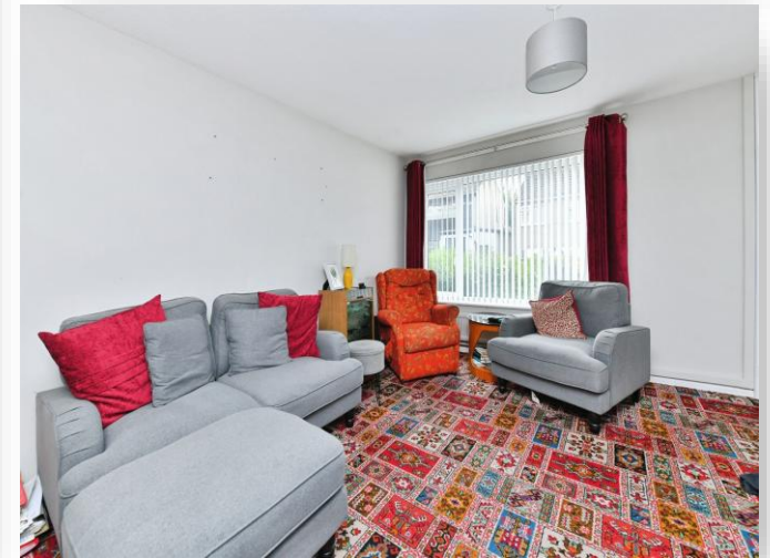
Kingston Close, Plympton PL7 2XA