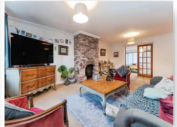
Ashburton Road, Ickburgh, Thetford, IP26 5JA