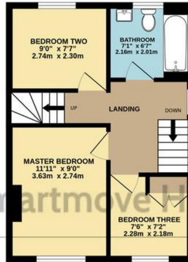
1ST FLOOR 354 sq.ft. (32.9 sq.m.) approx.