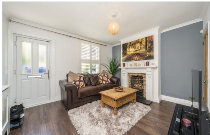
Red Lion Lane, SE18