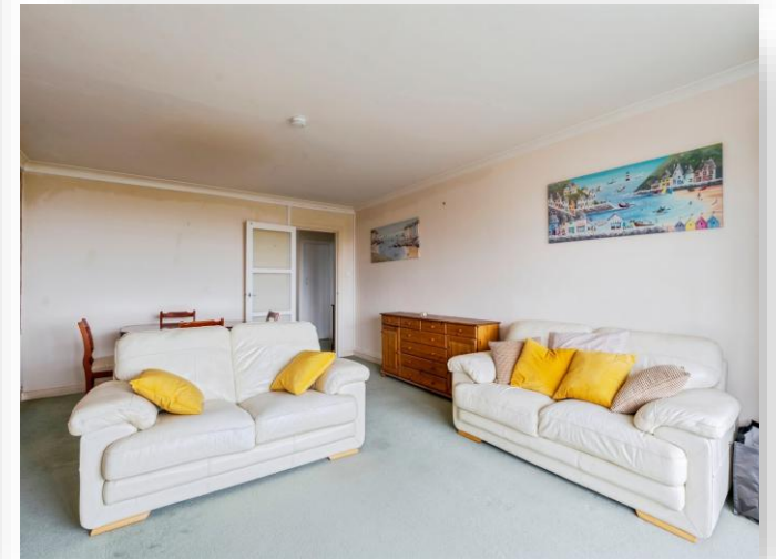
Francome House Brighton Road, Lancing BN15 8RP