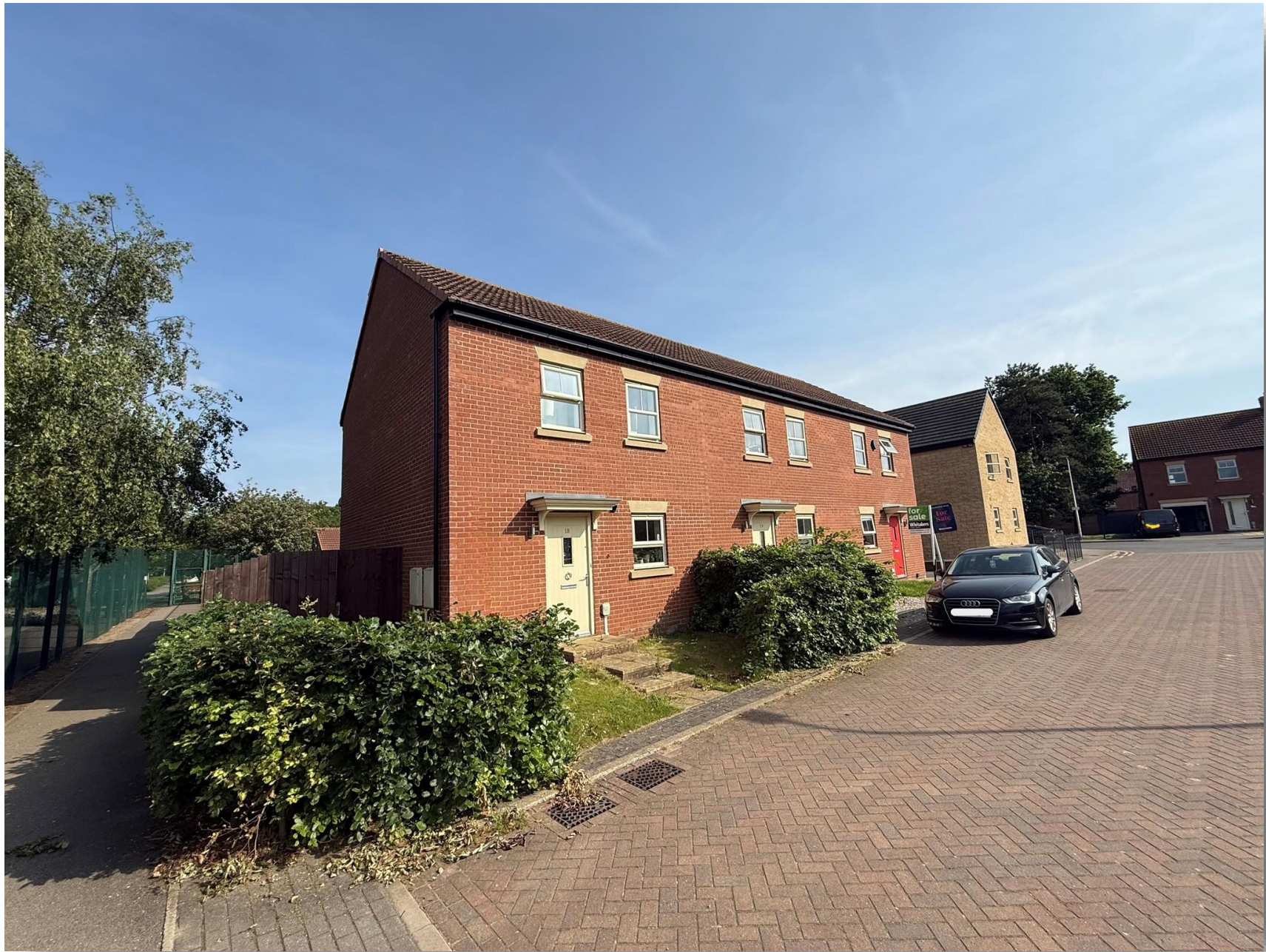
Frances Brady Way, Hull, HU9 3BW