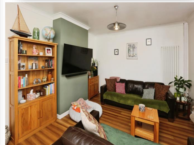
Priory Road, Gosport PO12 4LG