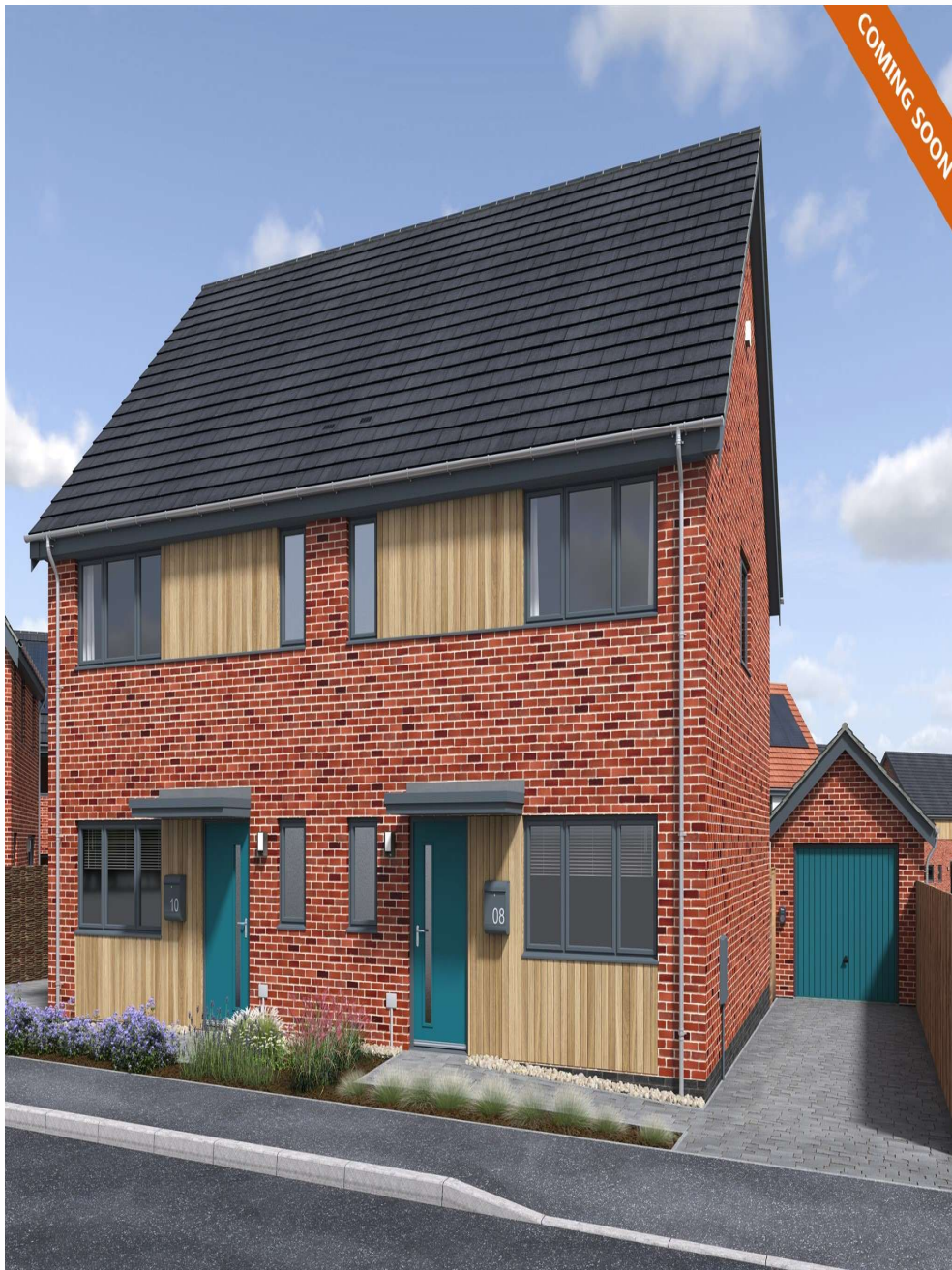
Atlas, The Carriages, Dereham, NR20 4DW