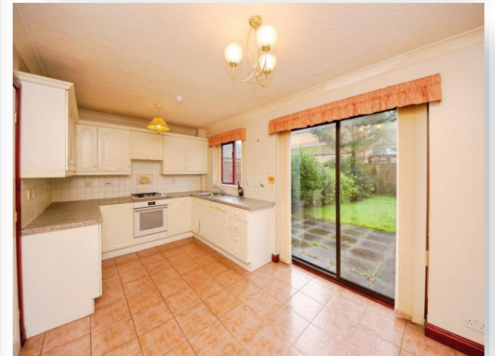
Yew Tree Close, Wirral CH49 5PA