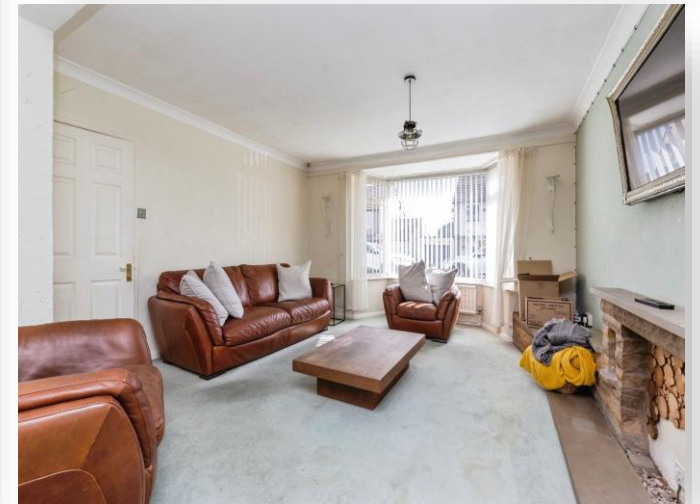
Rainford Avenue, Stockton-On-Tees TS19 9DJ