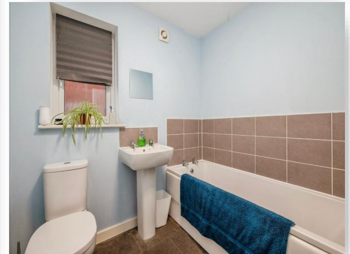
Currie Close, North Walsham NR28 0FU