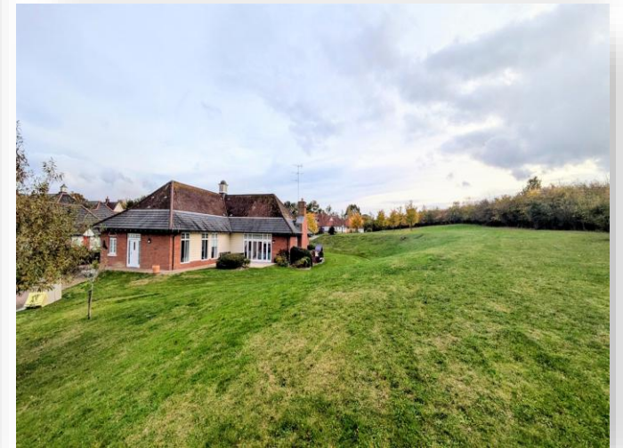
Meadow Park, Braintree, CM7 1TD