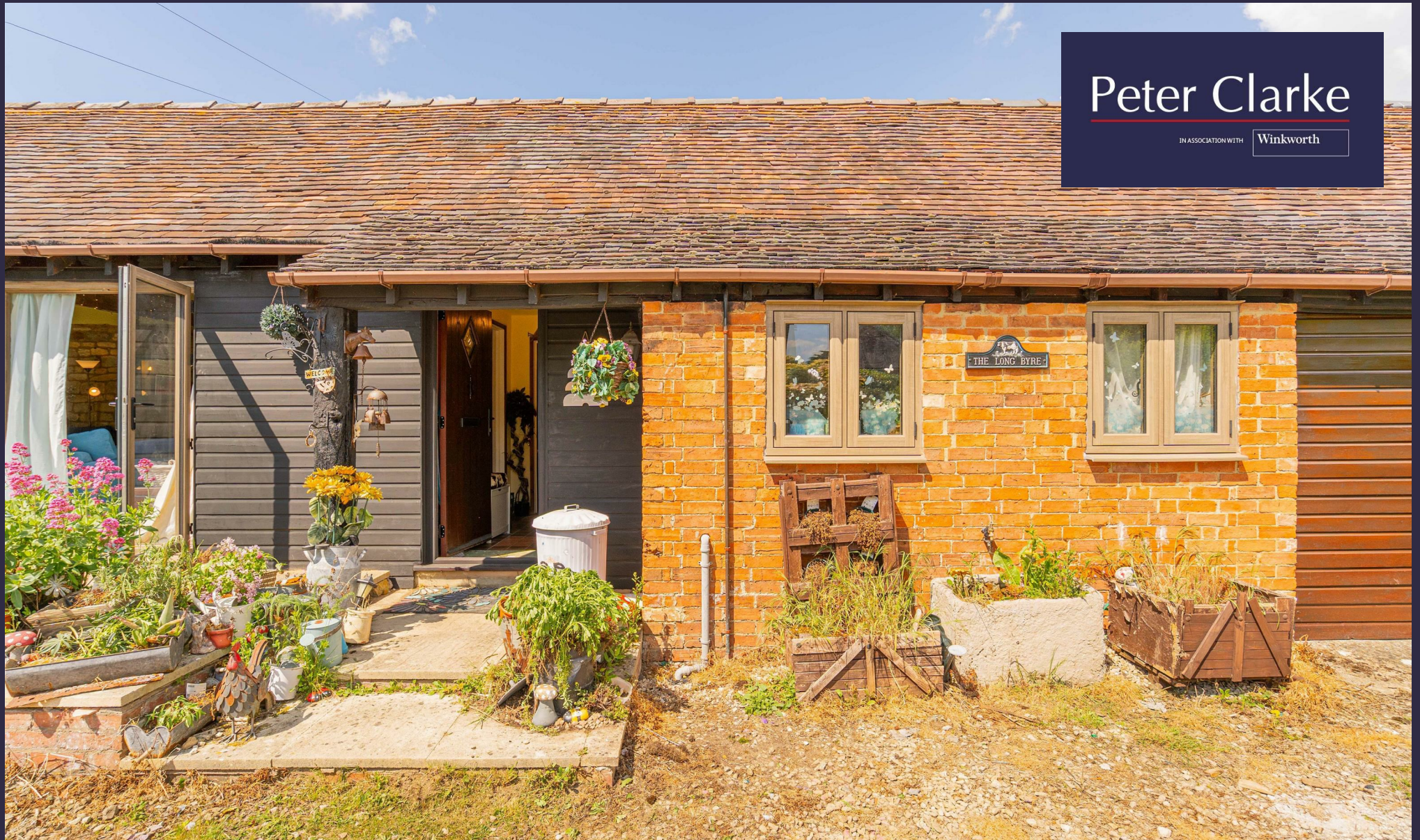
The Long Byre Pillerton Hersey, Pillerton Hersey, Warwick, CV35 0QA