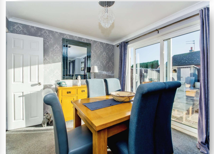
Finney Close, Coningsby Lincoln LN4 4JY