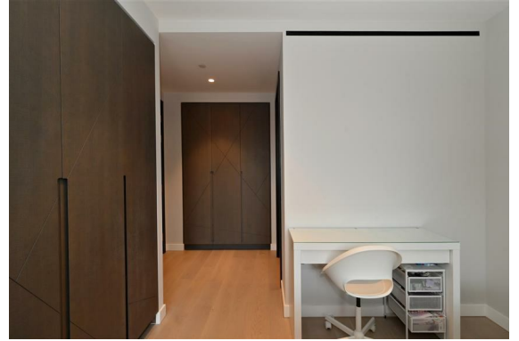
Tryptich Approx. Gross Internal Area 1084 Sq Ft - 100.71 Sq M