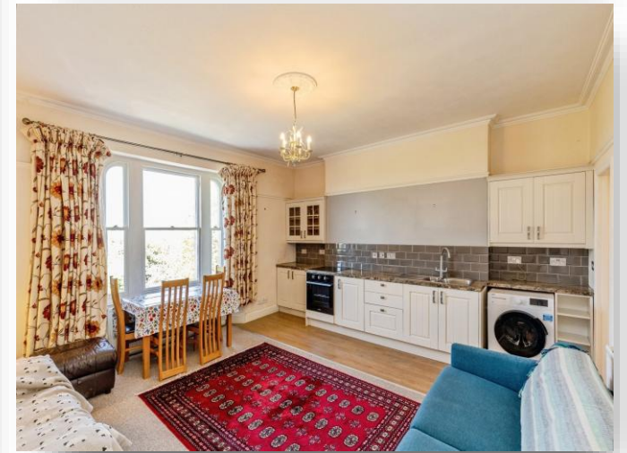
Second Floor Flat Upper Belgrave Road, Clifton Bristol BS8 2XL