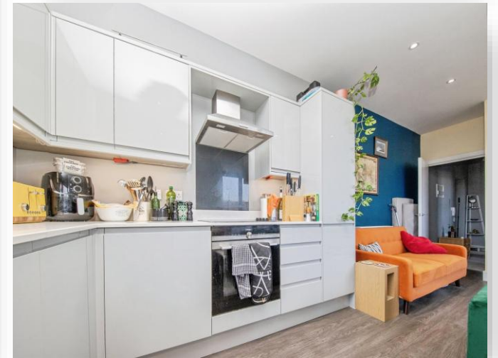
Princes Street, Ipswich, IP1 1QU