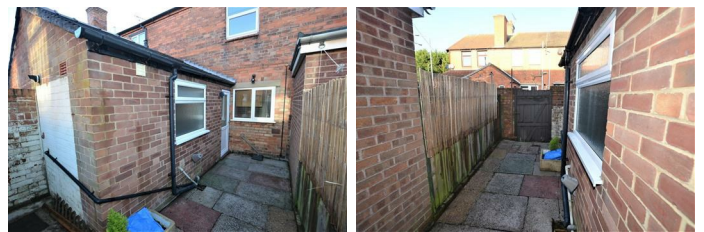
To the rear is a paved yard with access.