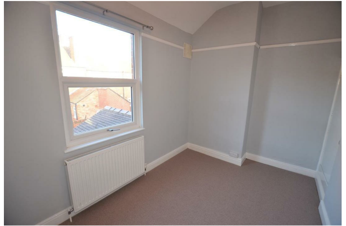
Having a recessed deep storage cupboard, radiator and UPVC double glazed window to rear aspect.