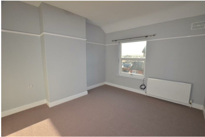
Having radiator and UPVC double glazed window.