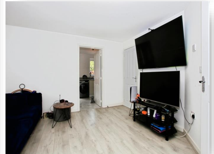
Brutus Close, Stanground South PETERBOROUGH PE2 8WP