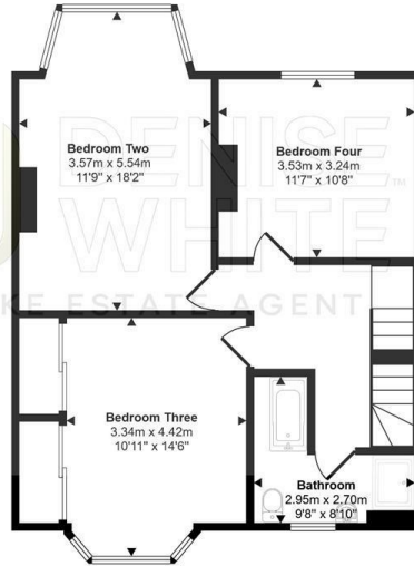
First Floor Approx 64 sq m / 689 sq ft