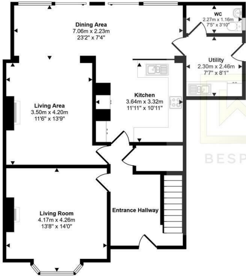
Ground Floor Approx 85 sq m / 911 sq ft

Approx Gross Internal Area 187 sq m / 2010 sq ft