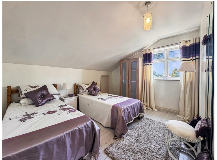
With a window to the front aspect and eaves storage.