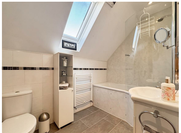
With a Velux windows, fitted with a low level w/c, inset wash basin with storage under and a 'P' shaped bath with a glass screen and shower over.