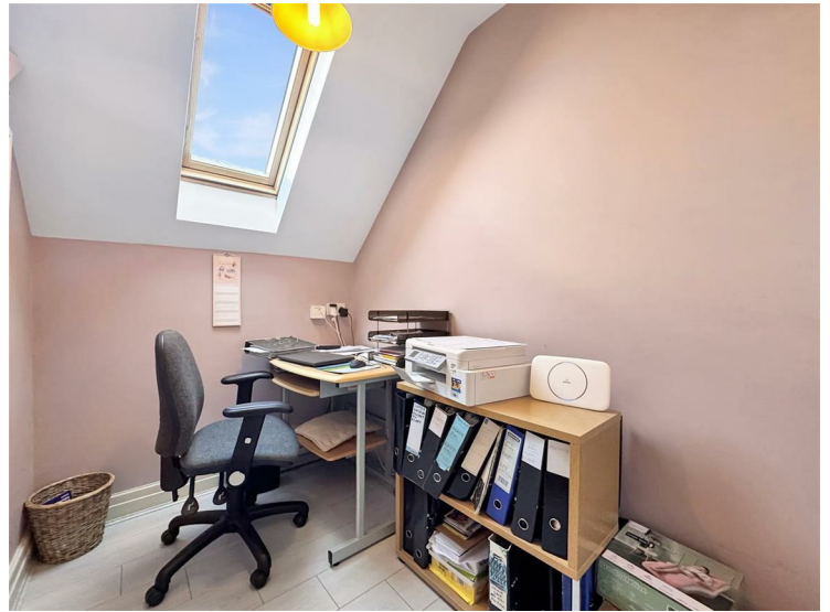
With a Velux window.