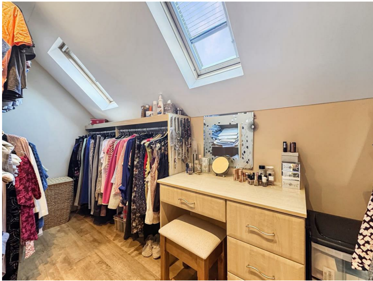
With two Velux windows and ample fitted hanging and shelving spaces.