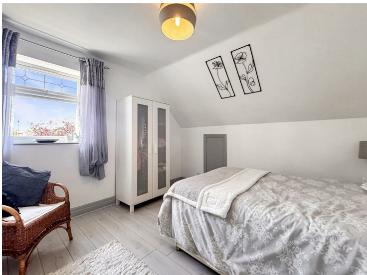
With a window to the front aspect and eaves storage.