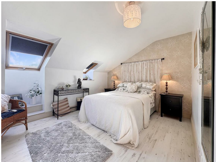
With two Velux windows to the side aspect.