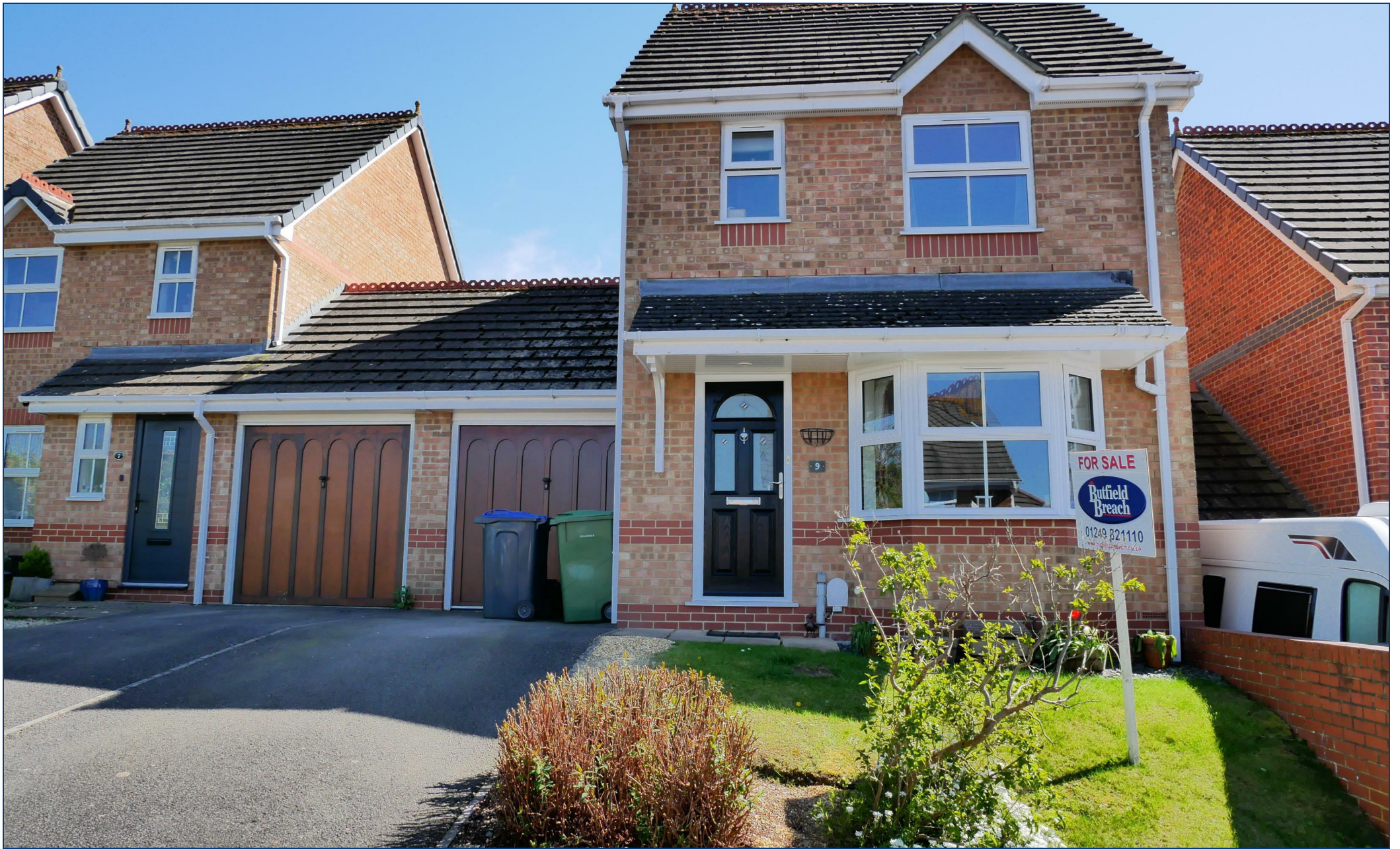
Portland Way, Calne £284,000