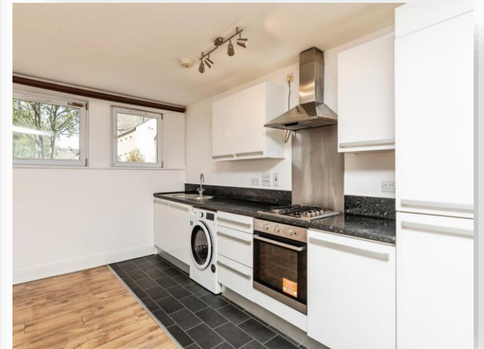
Bruntcliffe Chapel Bruntcliffe Road, Morley Leeds LS27 0QF